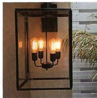
Tekna wall sconces, inspired by the craftsmanship of old trains and ships, cast a dreamy glow.