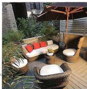
Unopiù's umbrella shades cozy WaProLace chairs and sofa; red pillows add a touch of color.