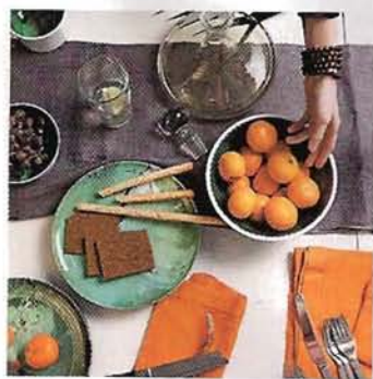
Bright linens and elegant plastic plates and vessels make for a sleek, cheery summer table.

personalized accents: Vierkant concrete planters, nautically inspired Tekna lighting fixtures, and plenty of warm touches. "What comes to mind when I think of an outdoor retreat," she says, "are great fabrics, blankets for cool evenings, scented plants, and soft colors." With these few principles as a guide, Gardner's goal—to turn her piece of nature into a relaxing space that fosters her guests' enjoyment—is achievable for any city dweller, whether their outdoor space is an expansive terrace or a simple rooftop. —Katie Mendelson