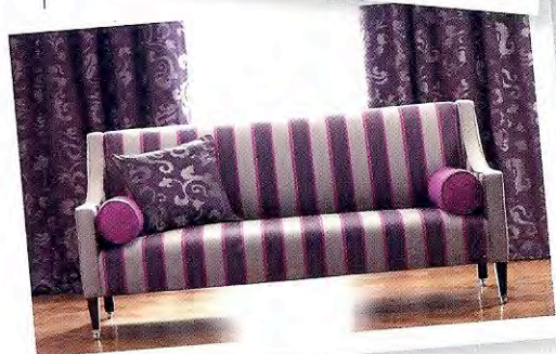
Color and pattern define the new Lanza and Fiona collections from Romo fabrics